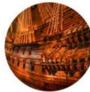
Vasa Ship Museum