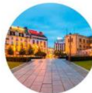
Oslo walking tour