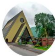
Norwegian Maritime Museum