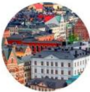
Walking tour of Stockholm including historic Gamla Stan