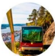
Fløibanen funicular to Mount Fløyen