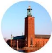
Stockholm City Hall