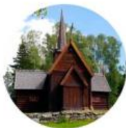
Malhaugen Open-Air Folk Museum