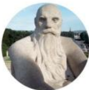
Frogner Park sculpture garden