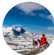
Jotunheimen scenic drive