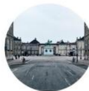
Copenhagen walking tour