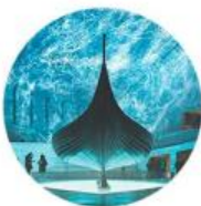
Bygdøy Viking Ship Museum