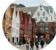
Bergen walking tour